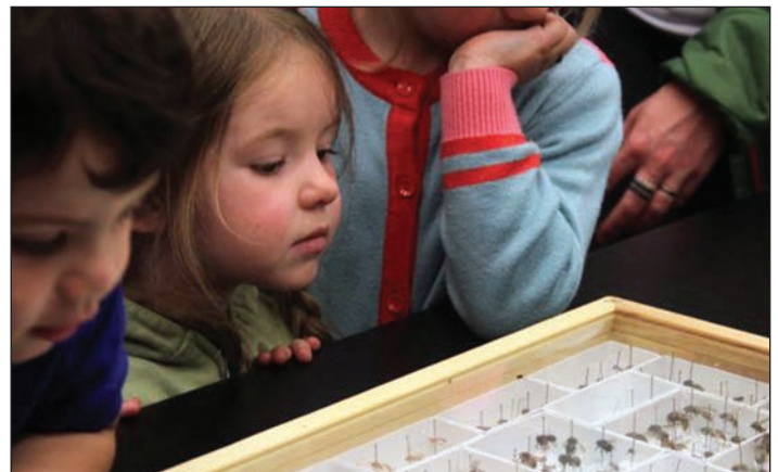
A tray of mounted bee specimens captures the attention of students