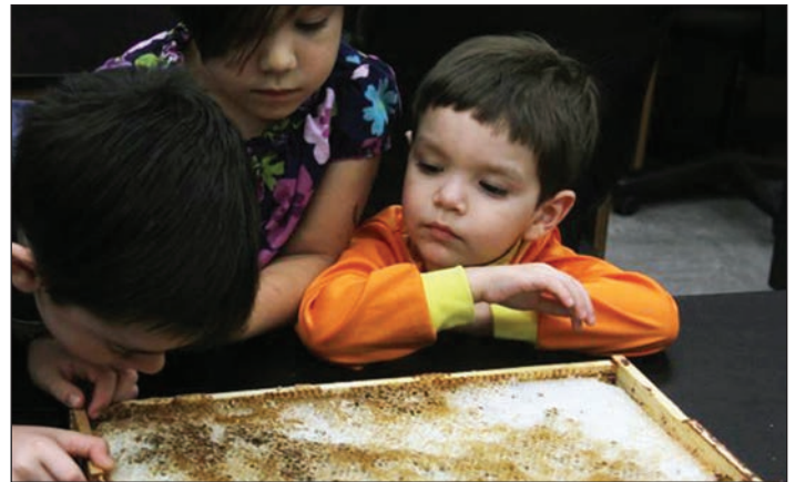
Students examine a piece of old honeycomb